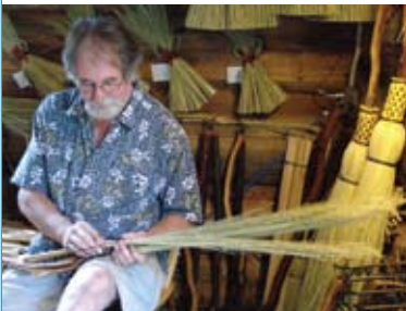
North Woven Broom Company

Just over the border in Lister, British Columbia, follow signs to Sproule's Scenic Acres, and pick your own hydroponic strawberries and blueberries (in season). A little farther up the road in Creston, Columbia Brewery offers free tours on weekdays in summer. A peaceful scene awaits at the Creston Valley Wildlife Management Area . Wildlife nest and feed in the ponds, and boardwalks wind through much of the marshy area, which is open 24/7. During visitor center hours, guided voyager canoe trips glide past great blue herons, osprey, beaver dams, and more. Overnight at RoseHaven Farm Bed and Breakfast, just 15 minutes' drive away, which overlooks the valley and is backed by mountains.