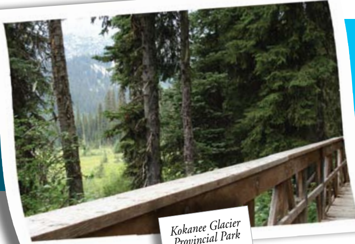
Kokanee Glacier Provincial Park