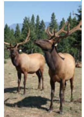
Selkirk Mountain Elk Ranch

Dawn is the best time to ride bikes on top of the old town dyke to Kootenai National Wildlife Refuge, where waterfowl find a resting spot on the Pacific Flyway, and moose wander to feed among the marshy grass.