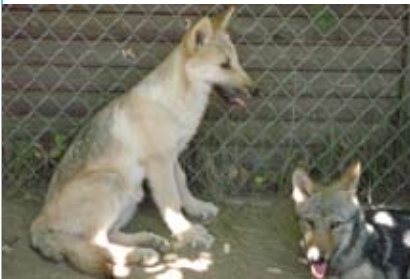
Wolf pups at Wolf People

The International Selkirk Loop in Idaho, Washington, and southern British Columbia, Canada, is rightly billed as remote, uncrowded, and undiscovered. The drive on mostly two-lane roads in towns between the Selkirk Mountain range and the Purcell Mountains oozes adventure. Hike near big game such as moose and elk, canoe among protected wildfowl, hunt for sweet huckleberries in summer. Here the beer's as strong and locally brewed as the coffee.