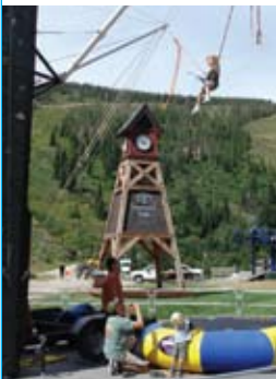
Schweitzer Mountain Resort